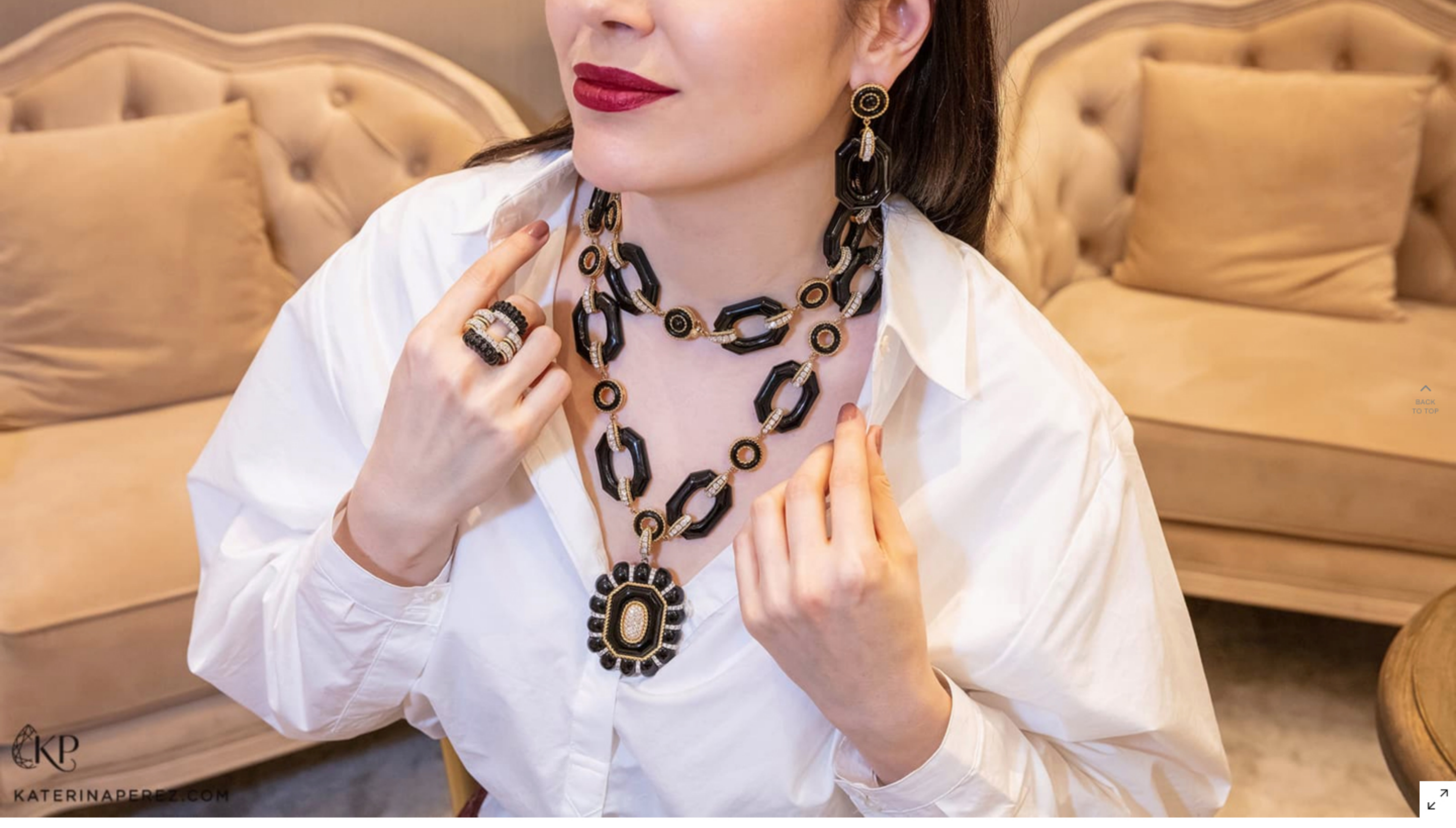
Veschetti jewellery suite with onyx and diamonds in yellow gold

Chiara Veschetti: We have used them from the beginning because we like contrast between the two different kinds of stones, both the colours and the innate differences between the materials. We feel these give the jewel a stronger character. The colours of hard stones have a unique, strong energy - they give a lot of life to the jewels.