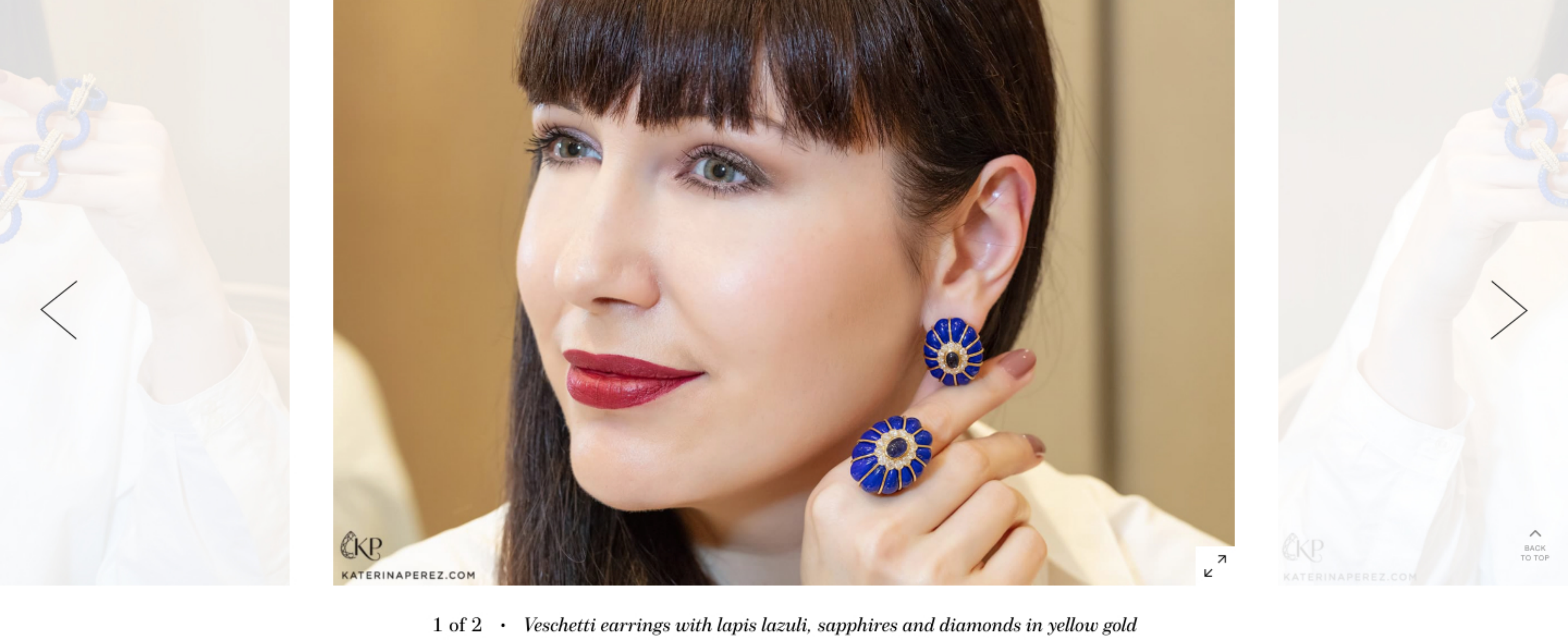
1 of 2 · Veschetti earrings with lapis lazuli, sapphires and diamonds in yellow gold

H aute Joaillerie designs that feature opaque gems is a recurrent trend that returned to jewellery a few years ago. More and more artists as well as jewellery lovers appreciate precious adornments from the aesthetic point of view, rather than their investment power or as a symbol of status. This results in exploration of various colour combinations, a play on contrasts between strong hues of hard stones and the sparkle of transparent gems, as well as experiments with volume in jewellery - and this is exactly what the Veschetti family does in their creations.