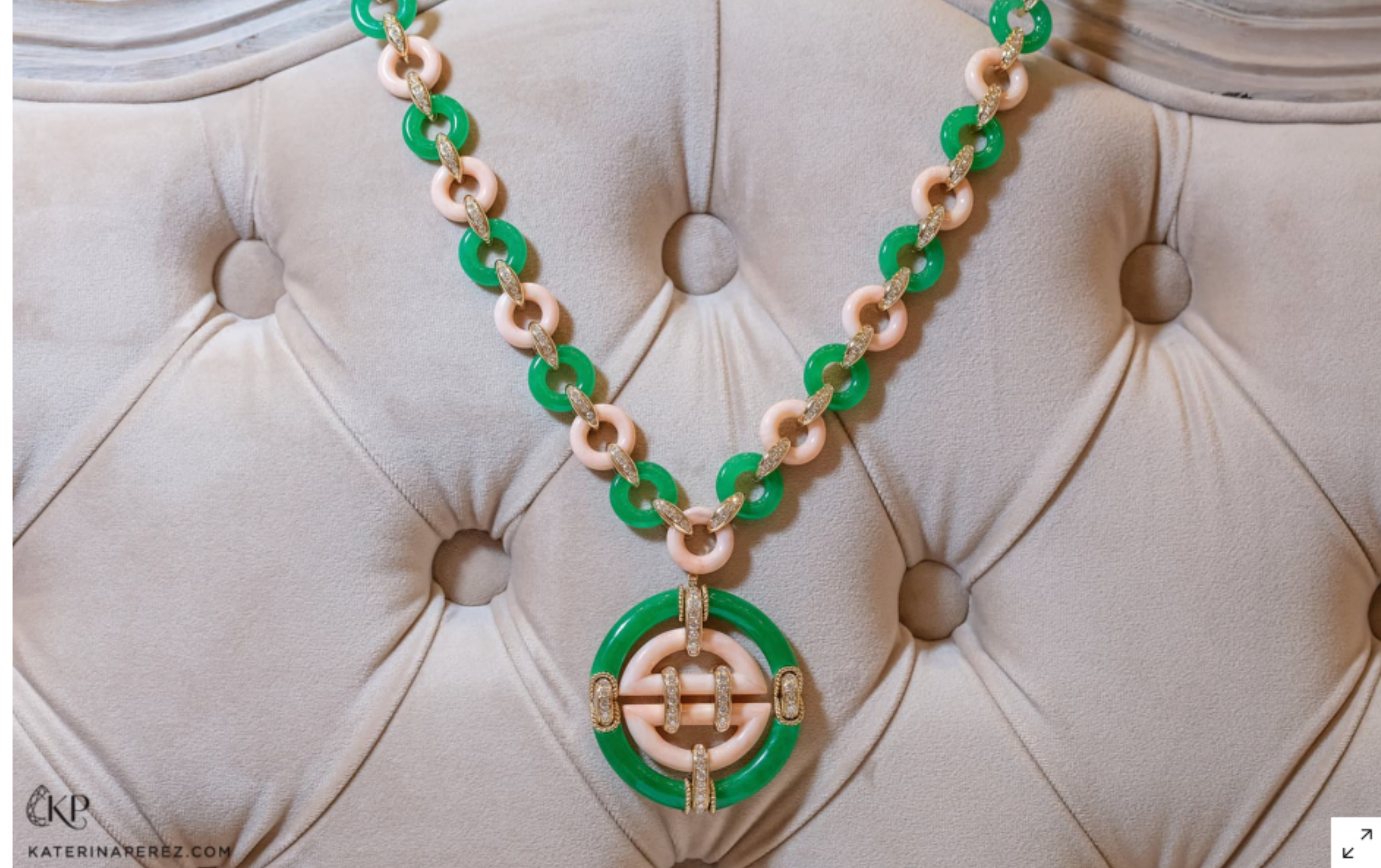
Veschetti sautoir with jade, Angel Skin coral and diamonds in yellow gold

CV: The most important reason to have great experience working with hard stones is that it is important to understand the intricacies of this jewellery material. Our jewellers instinctively understand the right volume to give to the stone while cutting it, which can then fit perfectly within the gold of the finished jewel. We also have to consider the weight of a mineral in order to have not just an attractive jewel, but one that is comfortable to wear.