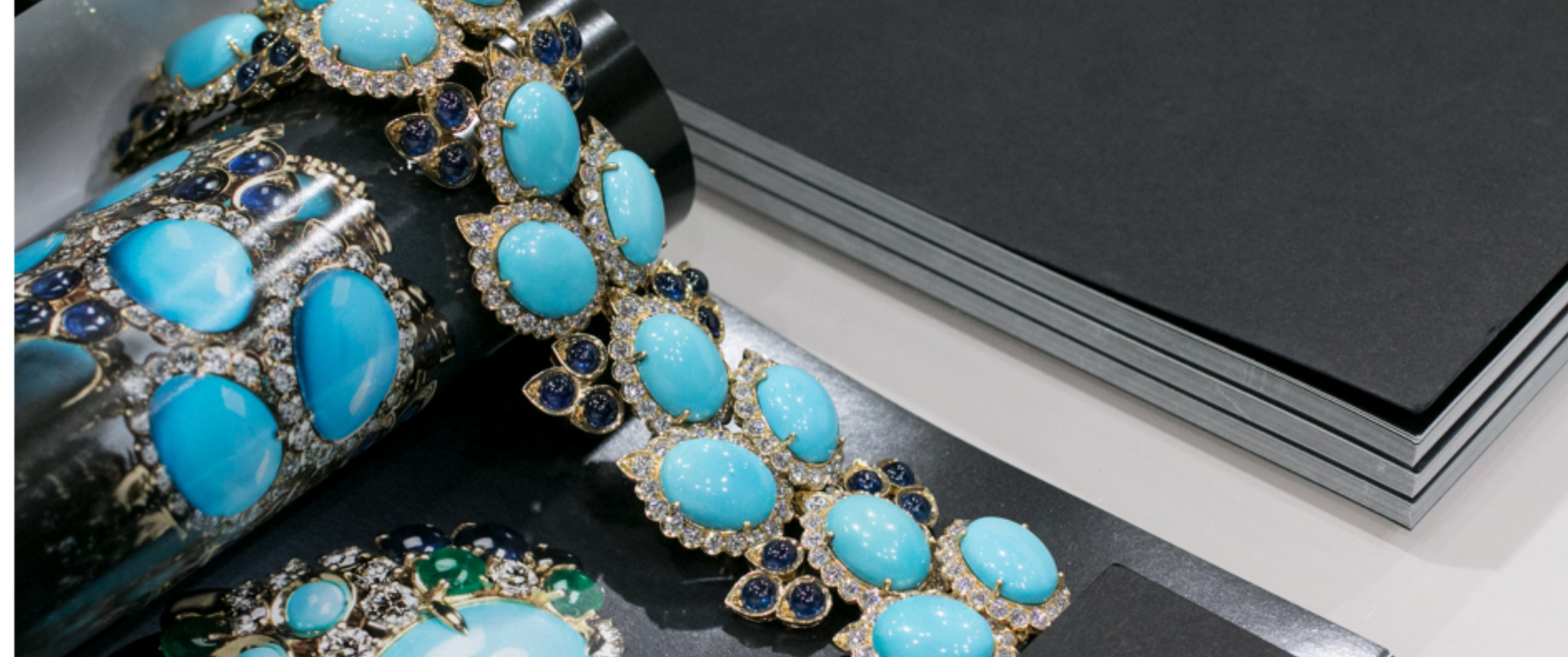
Veschetti bracelet with turquoise cabochons, sapphires and diamonds in yellow gold

CV: This was a turquoise jewellery suite, and I believe it was such a success because of the exquisite craftsmanship and the high quality of the turquoise. We use the best quality turquoise in the world - which now means that it is sourced from mines in Arizona, since the Persian supply is unavailable. In turquoise, what defines the best quality is a lack of patterning on the surface of the stone, so you can see uninterrupted colour that is totally consistent. And, crucially, a natural stone, not something chemically treated - this is a significant difference, because of the rarity, and therefore high price, of great, natural turquoise.