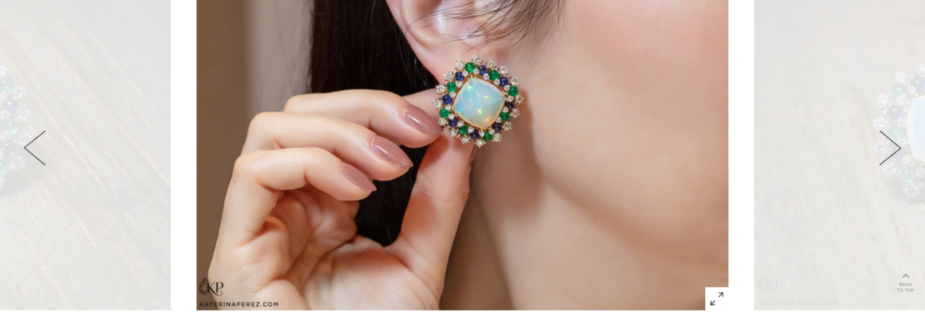
1 of 2 · Veschetti earrings with opals, emeralds, sapphires and diamonds in yellow gold

CV: The value of our jewels is not only in the inherent value of the materials we use, but in the manufacturing and creativity of the design. Every piece of jewellery is a work of art, and art isn't valued at the price of paints and the canvas, but on the creativity of the artist!