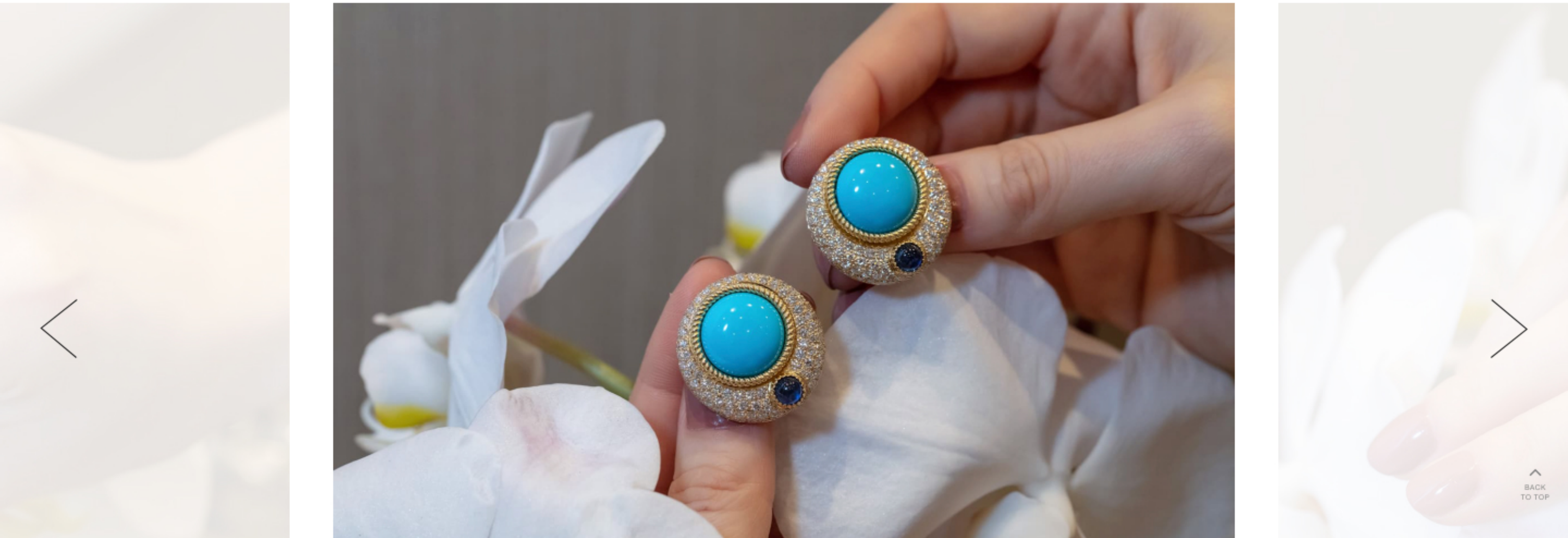
1 of 2 · Veschetti earrings with turquoise, sapphires and diamonds in yellow gold

CV: At Veschetti , we love both, but each stone is completely different and unique. It depends on the energy we feel every time we see a gemstone or hardstone mineral. Each tells its own distinctive story. Sometimes we start from the design and choose the stones accordingly to what suits it, and sometimes we create the design according to the stones which we discover and fall in love with.